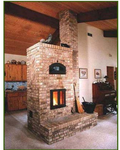
A masonry heater tends to form the centrepiece off a house.

A fully masonry alternative to such fireplaces is a masonry heater which uses its massive structure to store the heat from a fast-burning fire, then releases it slowly over the following several hours. Masonry heaters are highly specialized and must be built by experienced heater masons so they work correctly and are durable. Well-built masonry heaters are as efficient and clean burning as EPA certified stoves and fireplaces.