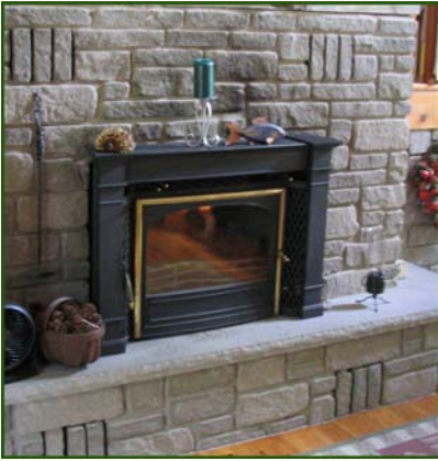
A fireplace insert converts a conventional fireplace into a heating system.

If you have a conventional wood burning fireplace, especially one made from brick, block or stone, you may be able to upgrade it to a supplementary heating system by installing an EPA certified fireplace insert. An insert is like a wood stove that has been adapted by its manufacturer to fit