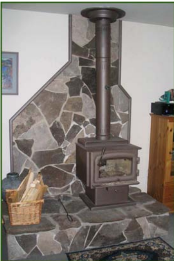
A wood stove is usually the most flexible and economical wood heating option.

A wood stove is the most flexible and economical wood burning device because it can be installed almost anywhere there is enough space for the installation and where the chimney can be routed straight up. An area about one and a half metres square (five feet square) is needed for the stove and minimum installation clearances. If you are in doubt about routing the chimney straight up through the house construction, consult an experienced wood heat