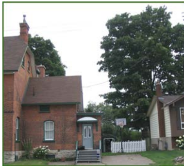
Does your smoke affect your neighbours?

your house is near the ventilation air intakes for an office or apartment building. Your smoke could be distributed throughout the building, affecting many people.