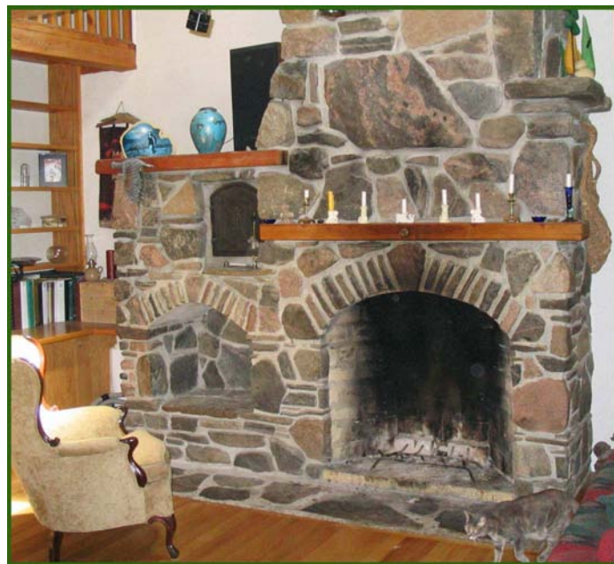
A beautiful and expensive fireplace, but notice the smoke stains on the stone arch and wooden mantel.

Homeowners who want a wood fire just for its visual appeal usually opt for a fireplace because the common, conventional fireplace is not an effective heater, but tends to be an attractive feature of a room even when no fire burns. However, conventional wood burning fireplaces, even elaborate expensive ones, often cause problems and disappoint their owners. The following problems are often reported by users of conventional fireplaces.