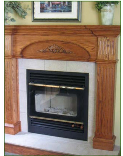
This fireplace could heat part of a large house or all of a small house.

An advanced technology fireplace combines the clean burn and efficiency of an EPA certified wood stove with the built-in look of a regular fireplace. There are models to suit most décor preferences, from rustic to formal. They have insulated cabinets which permit installation within combustible construction, and are vented through insulated metal chimneys. A factory-built fireplace does not need a concrete foundation, but can be mounted on a floor of standard construction. Because these fireplaces have large door openings relative to their chimney size, it is particularly important that the chimney be routed straight up, avoiding offsets that can introduce resistance to exhaust flow, increasing the likelihood of smoke spillage.