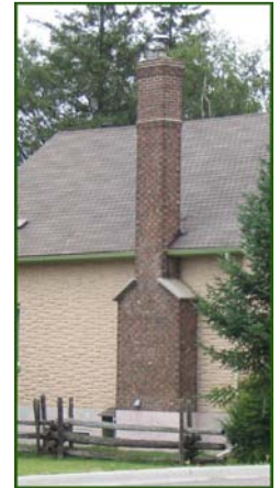
Outside chimneys do not function well.

The decision to add a wood burning system to a house should not be taken lightly. A basic wood stove and chimney installation normally costs at least $3000. Fireplace installations cost considerably more. A building permit is needed and insurance companies require that installations meet the rules found in safety codes. Finally, all new systems installed in urban areas should be designed and operated to produce the lowest possible smoke emissions.